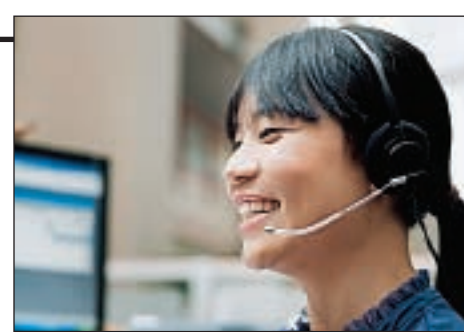
The consumer price index (CPI) helps monitor prices.