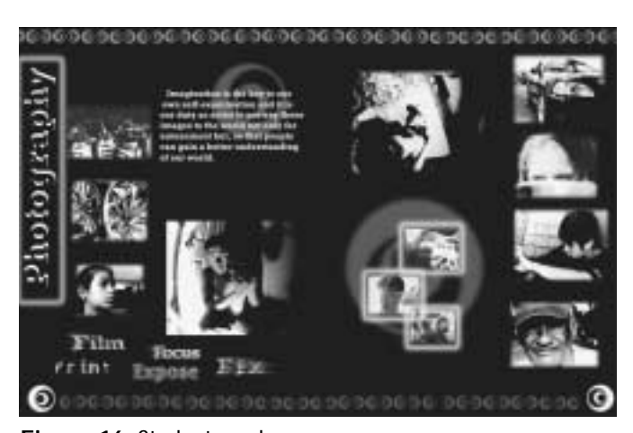
Figure 16 Student work.

Special Note: Using the layer options in an image editing program allows you to isolate and move one part of an artwork without disturbing the other elements. For example, type can be placed on top of images, and it can be edited and deleted without affecting the image underneath.