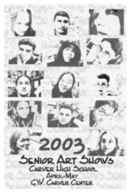
Figure 15 Student work.

Step 1 Brainstorm design ideas with senior classmates for a poster advertising a Senior Art Show. Jot down possible themes or catchy slogans. Try to come up with a theme or slogan that communicates something about who these senior classmates are as individuals and artists.